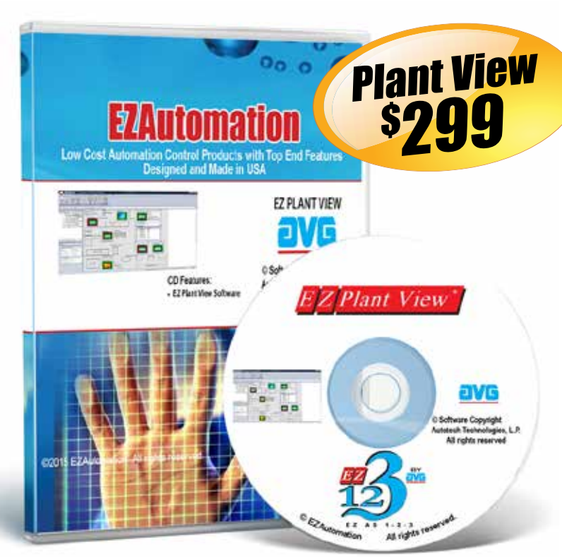
Part # EZ-SOFT-PLANT

Monitor & Control all your HMIs from Single Software (Macro View)