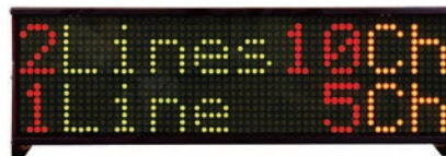
TRI color Indoor