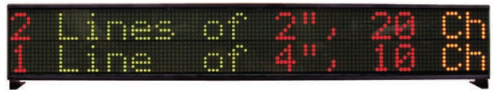
TRI color Indoor