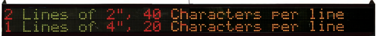
TRI color Indoor