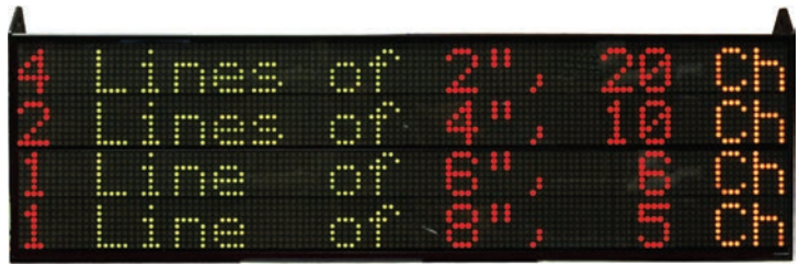
TRI color Indoor