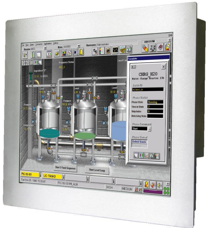
Panel-PC with Stainless Steel Front bezel

The UT-IPPLP-21-IGN Panel PC offers a TFT Display with a Resolution of 1920 x 1080 Pixel and is equipped with a LED Backlight.